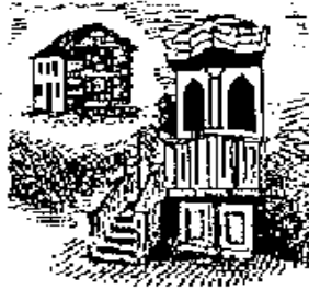
1st Seventh Day Baptist Church founded at Newport, Rhode Island in 1671